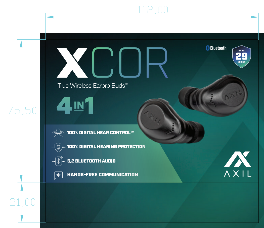
FLAP LID OUTER