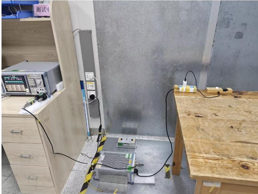
Radiated Spurious Emissions From 30MHz-1000MHz