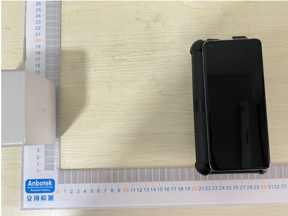
For position A Photo of MPE Measurement at 0 cm