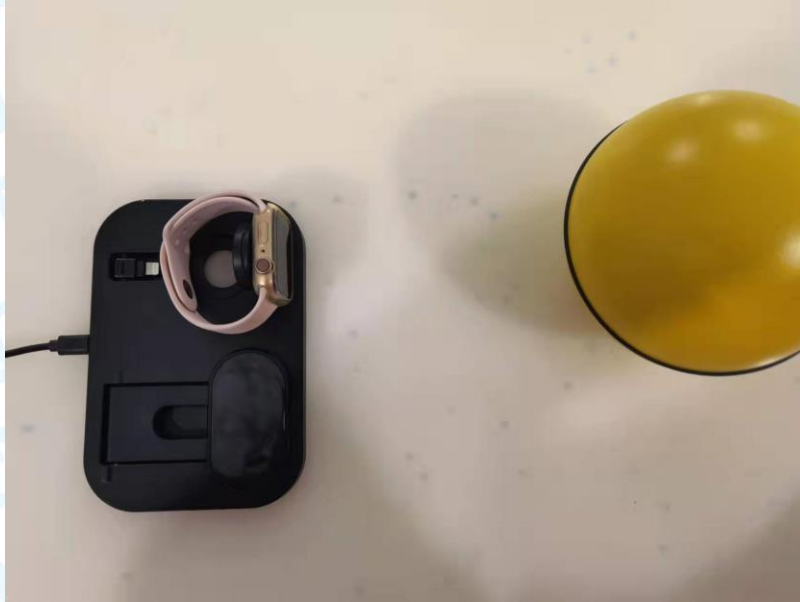
Test Set-up Photo