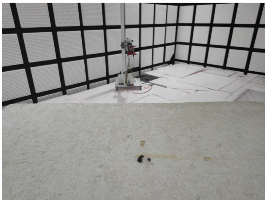
Radiated spurious emission Test Setup-2 left ear(Above 1GHz)