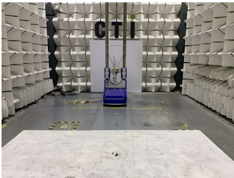
Radiated spurious emission Test Setup-1 right ear(Below 1GHz)