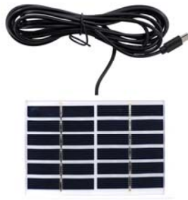
Solar Panel (x2 PCS)