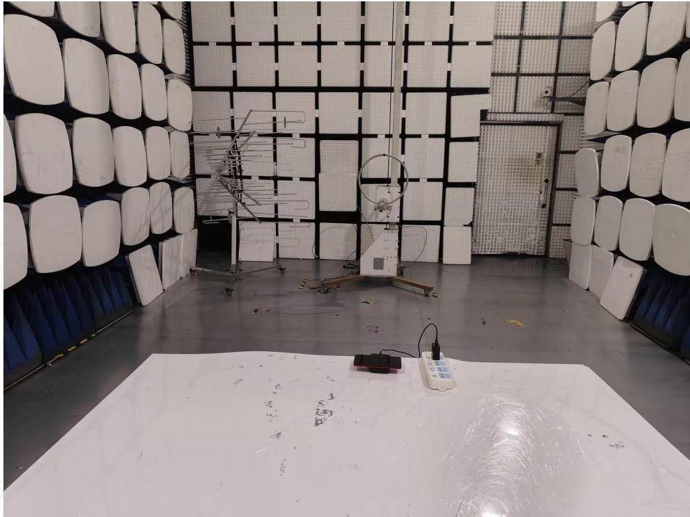
Radiated Emission below 30MHz-AC adapter charge mode