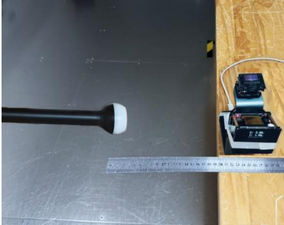
Test Set-up Photo