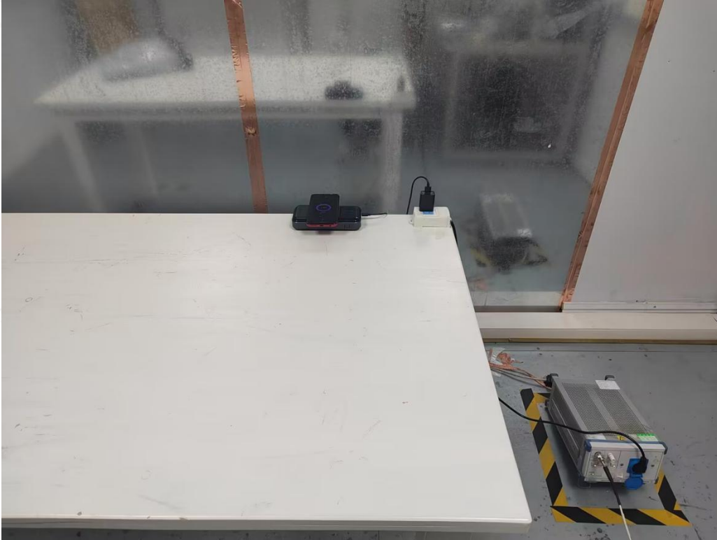
Conducted Emission-AC adapter charge mode