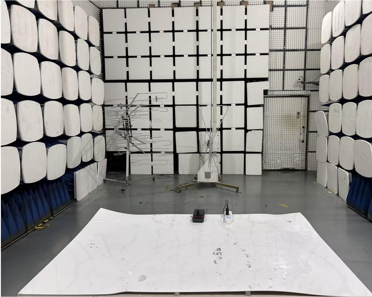
Radiated Emission below 1GHz-AC adapter charge mode