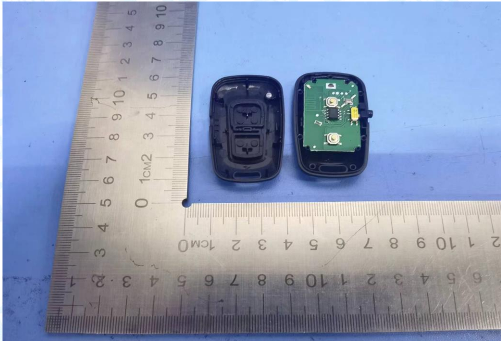
Photo 8 Internal of EUT