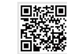
Scan the QR code above to download the client