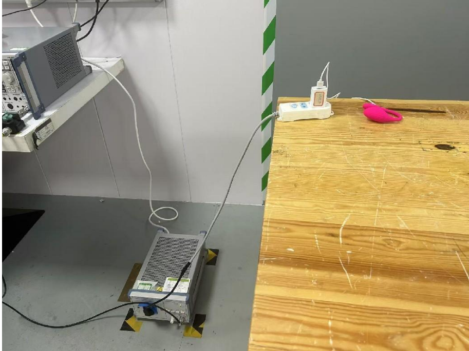
Conduction Emission Test