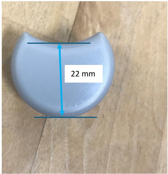
Maximum Base Length