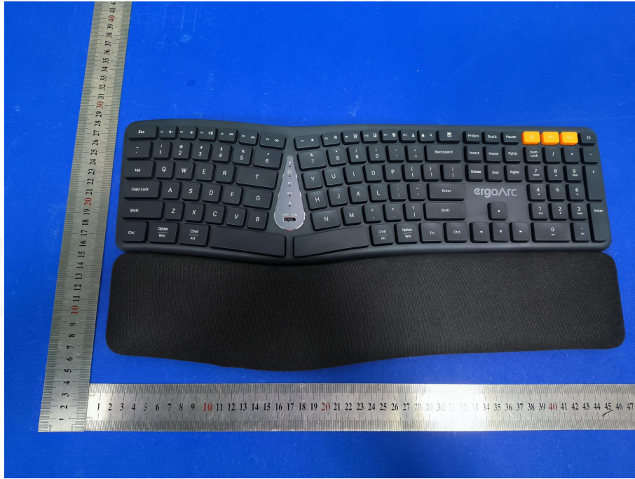
EUT Photo 2