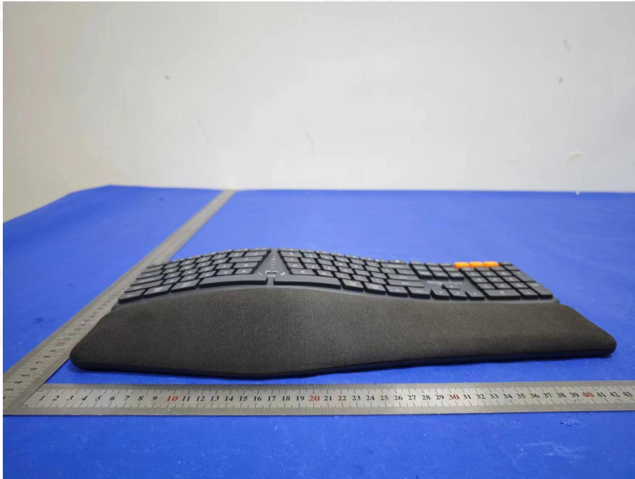
EUT Photo 6