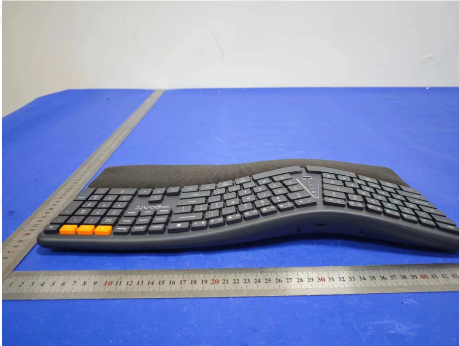
EUT Photo 4