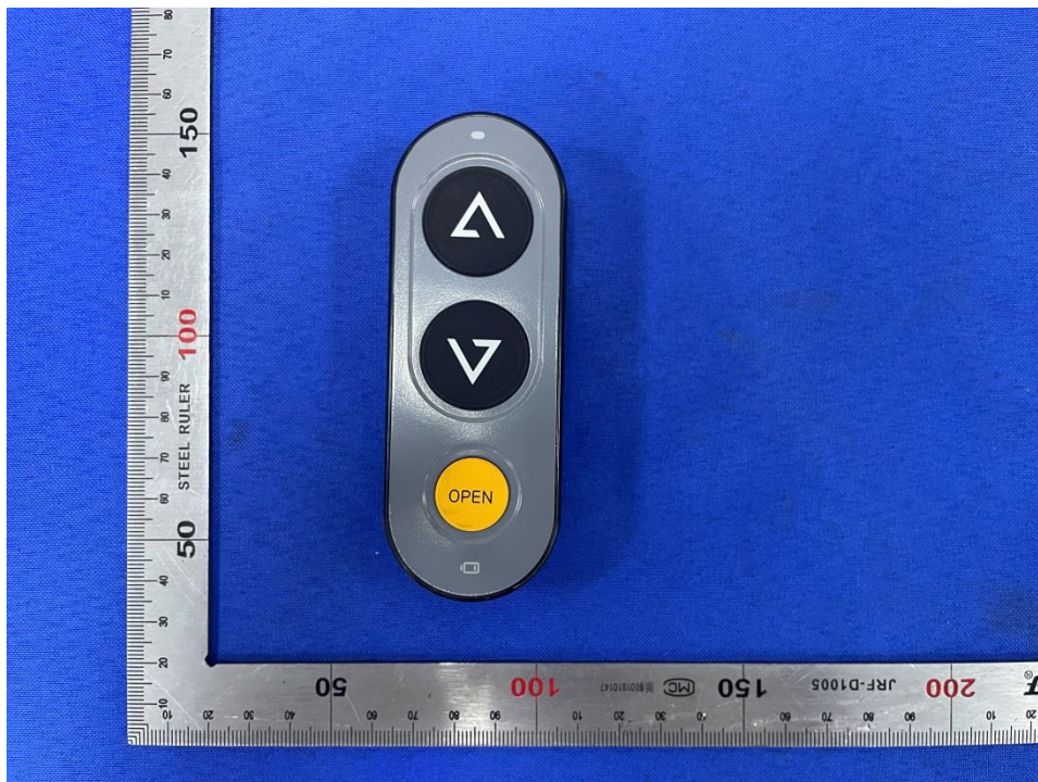
Front of the sample