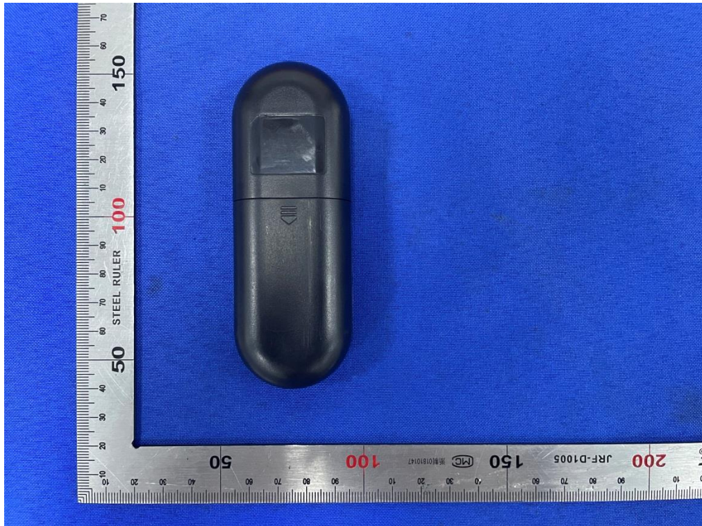
Rear of the sample