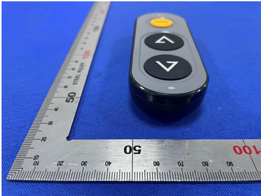
Top of the sample