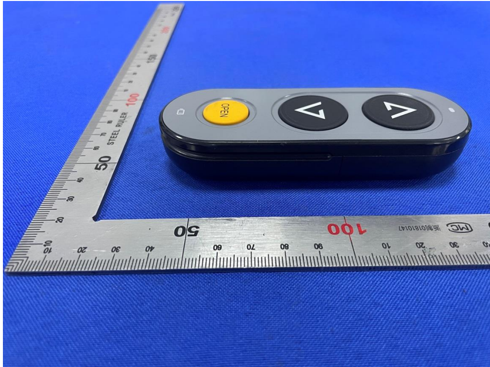
Right of the sample