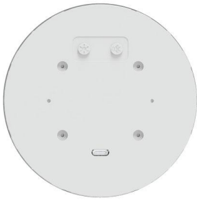
Bottom of lamp