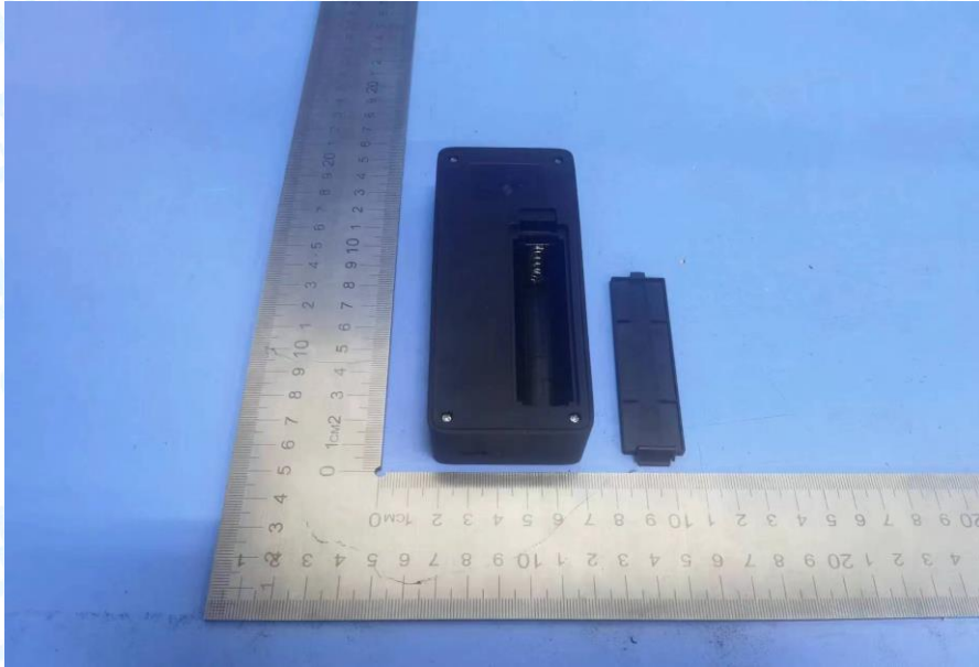
Photo 11 Internal of EUT