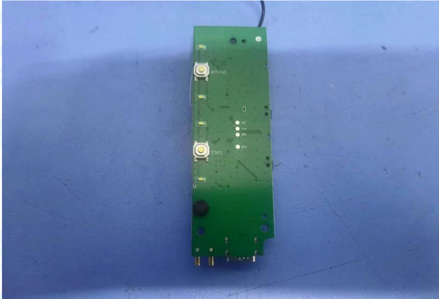
Photo 15 Appearance of PCB