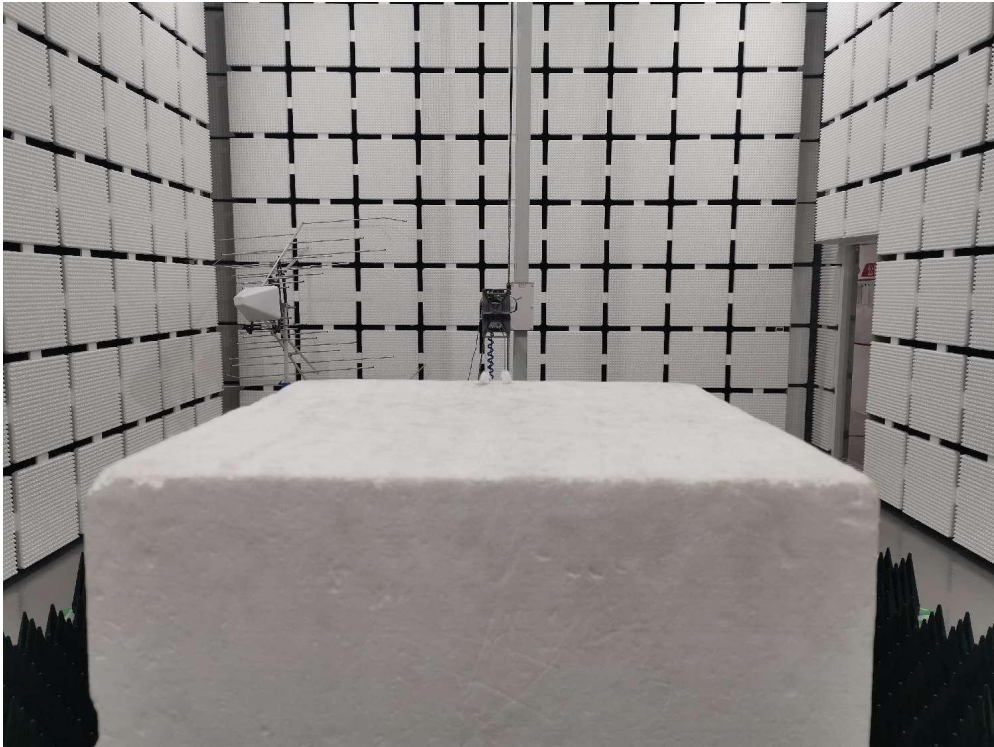
AC Conducted Emission