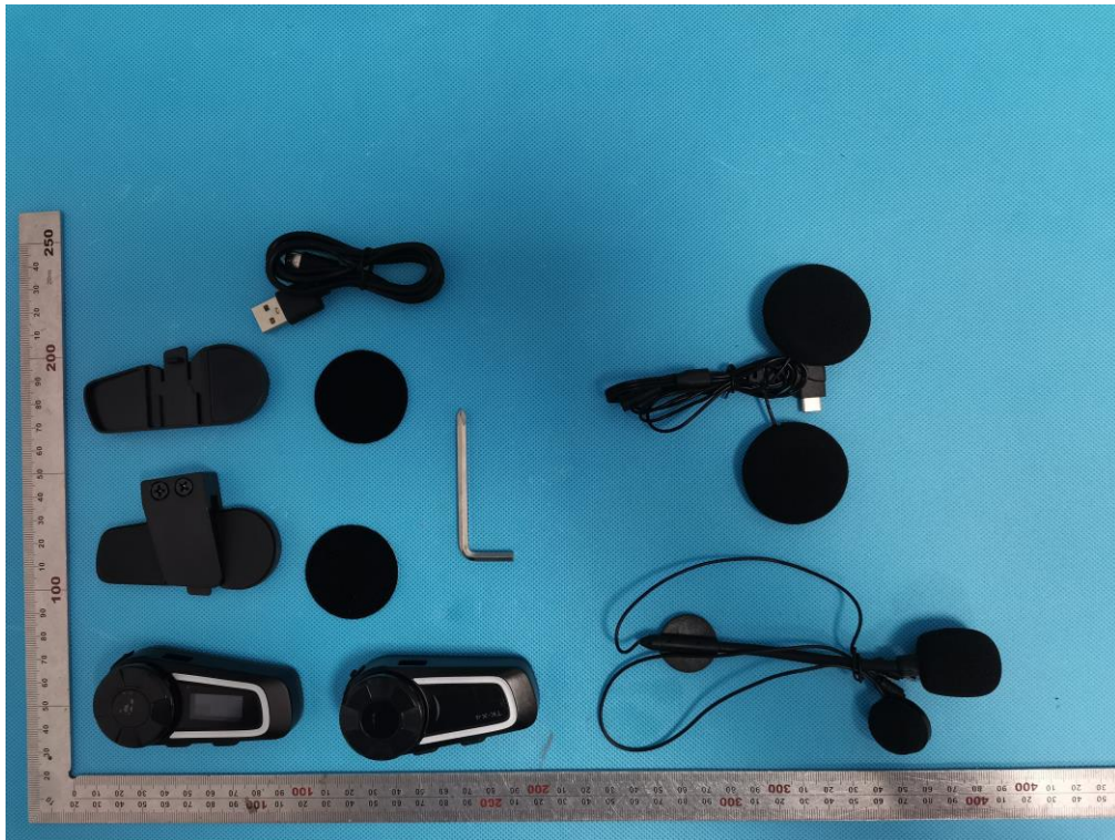
TOP VIEW OF EUT (Test Model: TK-X4SC)