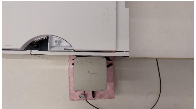
Note: The picture shows the worst case (W.C.) position.