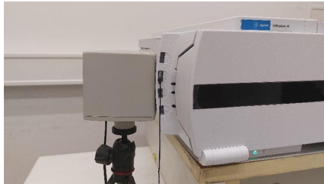
Note: The picture shows the worst case (W.C.) position.