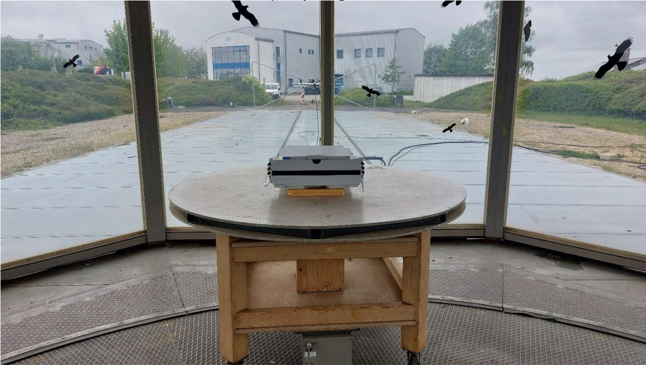
OATS 1 – Frequency Range: 30 MHz to 1 GHz