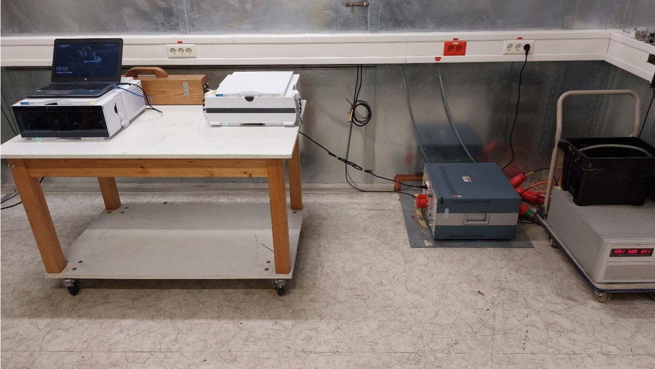
Shielded Room S2 – Frequency Range: 150 kHz to 30 MHz