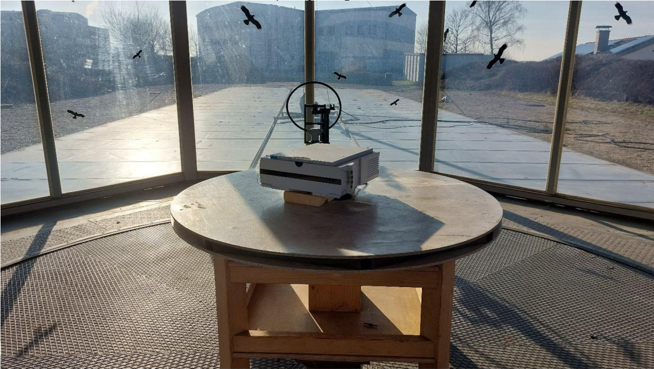
OATS 1 – Frequency Range: 9 kHz to 30 MHz