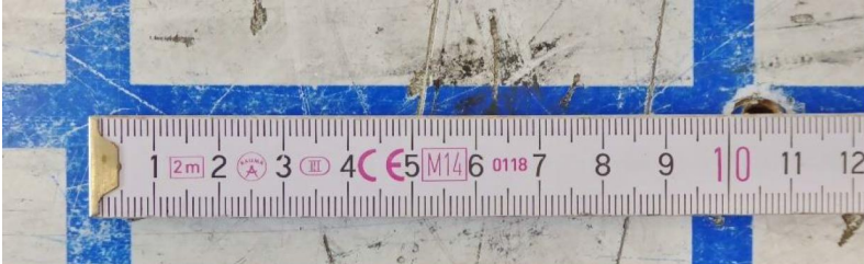
1 box \cong 10 cm x 10 cm