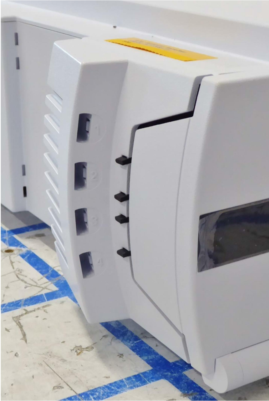
Front view – TAG reader

The test report merely corresponds to the test sample. It is not permitted to copy extracts of these test results without the written permission of the test laboratory.