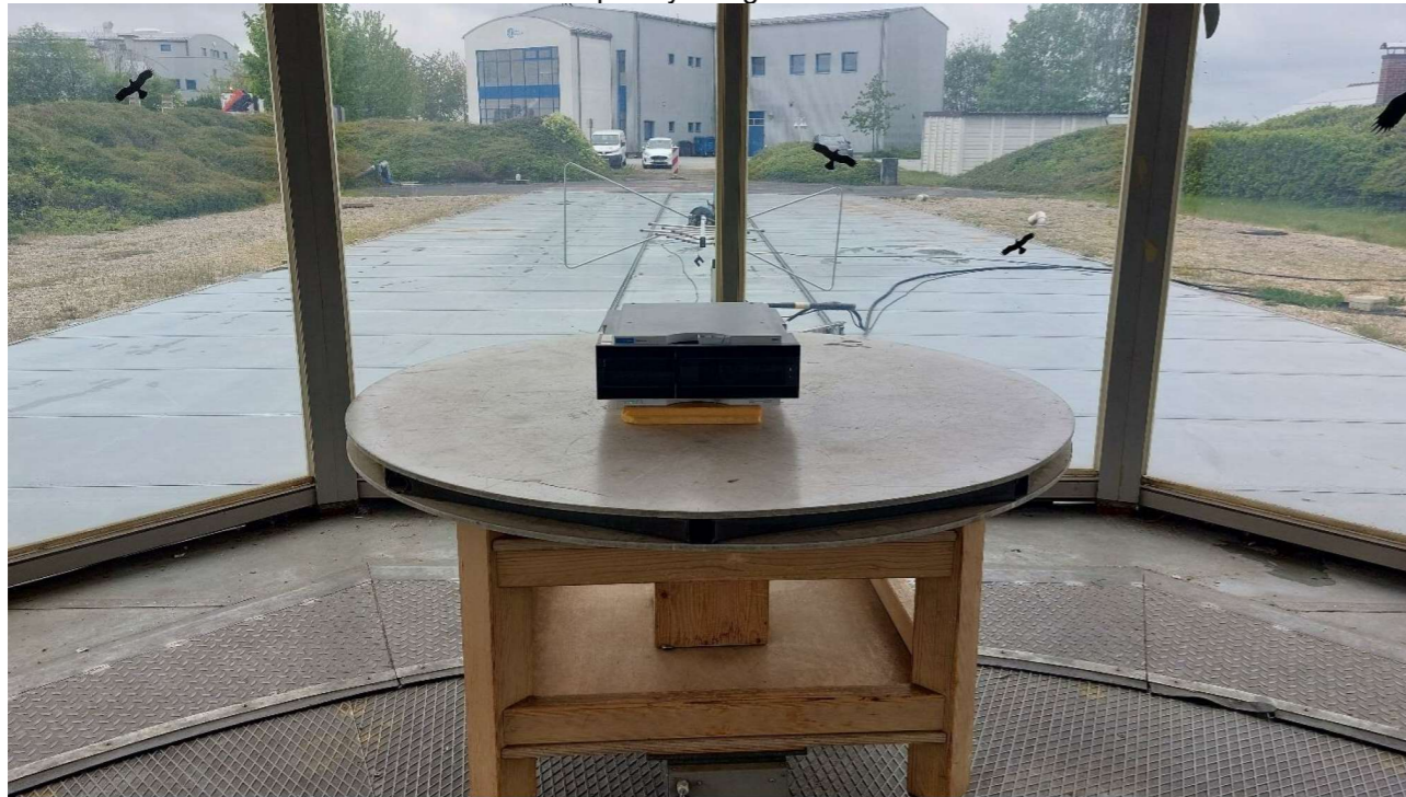
OATS 1 – Frequency Range: 30 MHz to 1 GHz