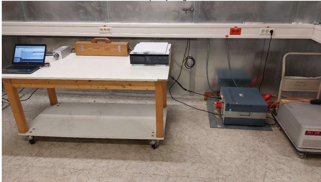
Shielded Room S2 – Frequency Range: 150 kHz to 30 MHz