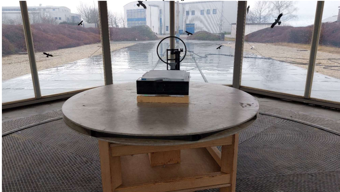
OATS 1 – Frequency Range: 9 kHz to 30 MHz