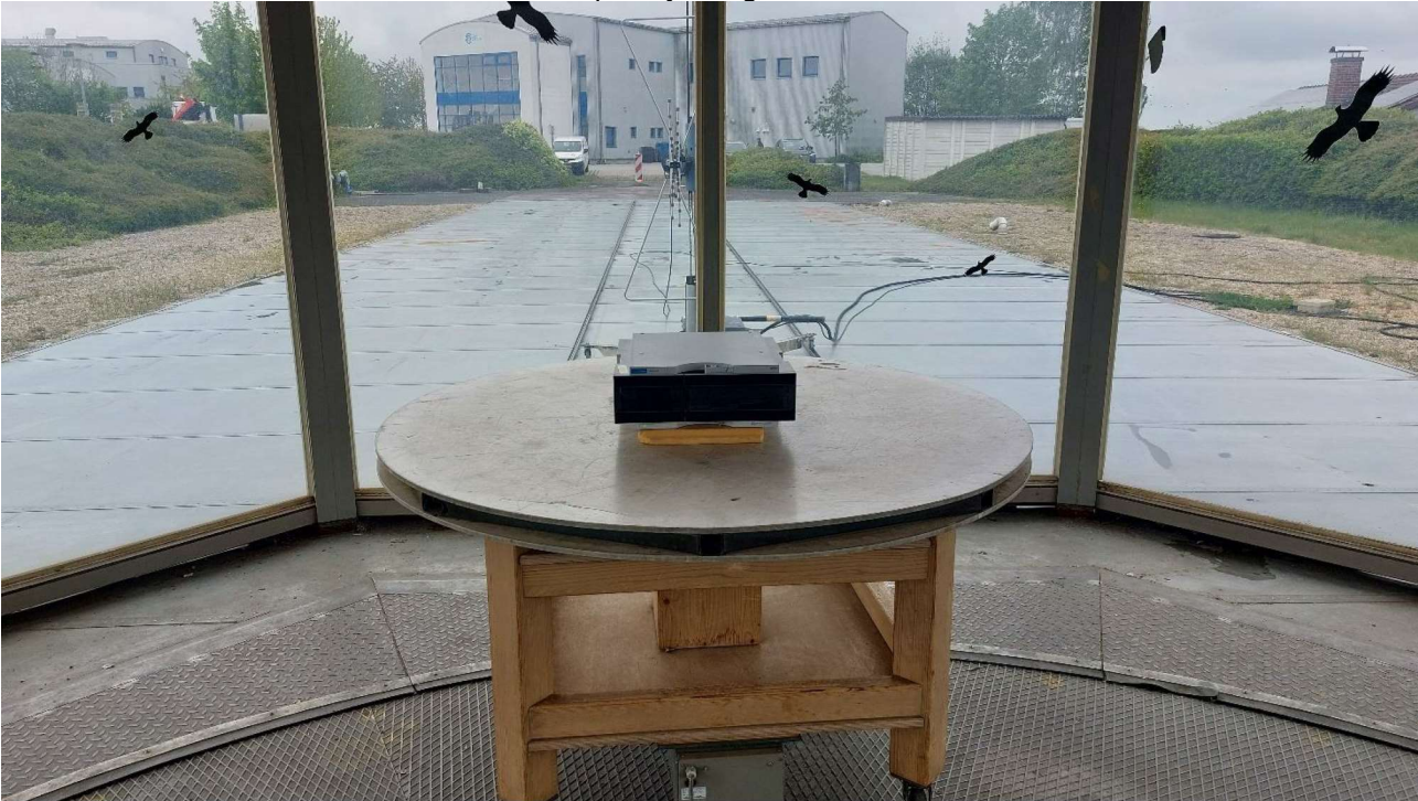
OATS 1 – Frequency Range: 30 MHz to 1 GHz