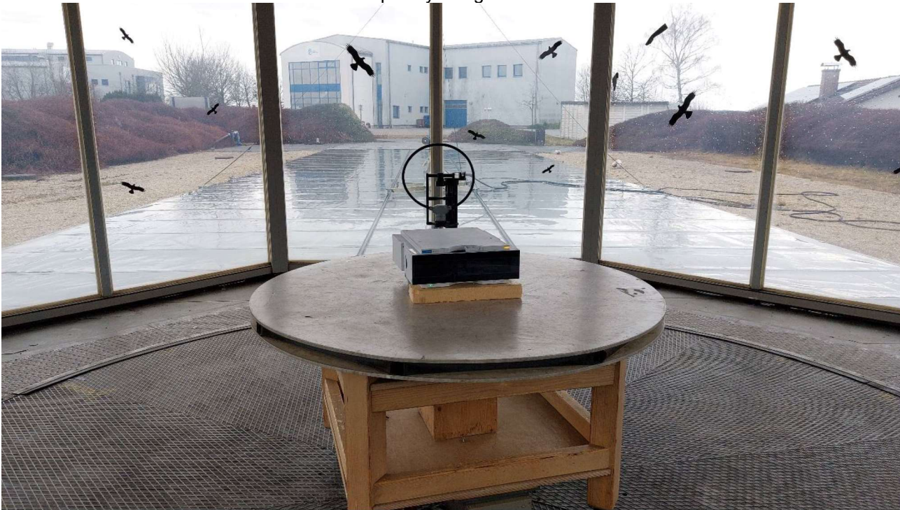
OATS 1 – Frequency Range: 9 kHz to 30 MHz