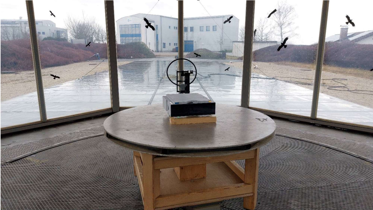
OATS 1 – Frequency Range: 9 kHz to 30 MHz