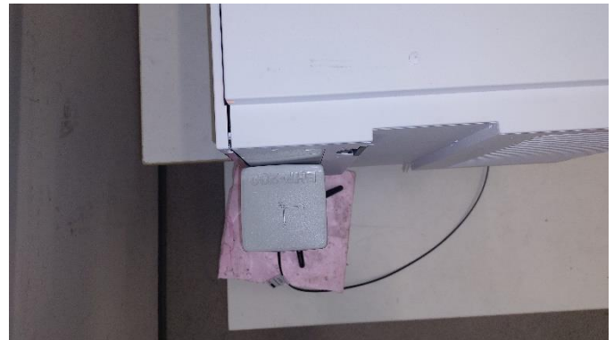
Note: The picture shows the worst case (W.C.) position.