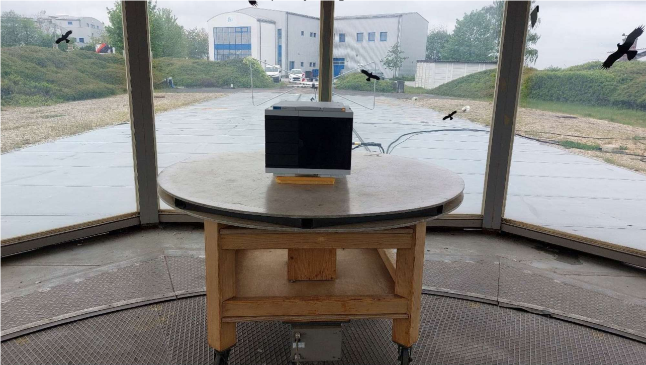
OATS 1 – Frequency Range: 30 MHz to 1 GHz