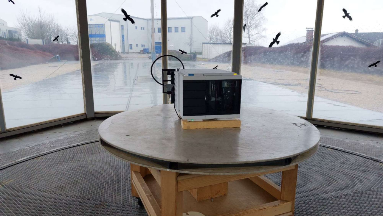
OATS 1 – Frequency Range: 9 kHz to 30 MHz