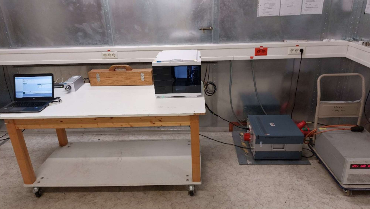
Shielded Room S2 – Frequency Range: 150 kHz to 30 MHz