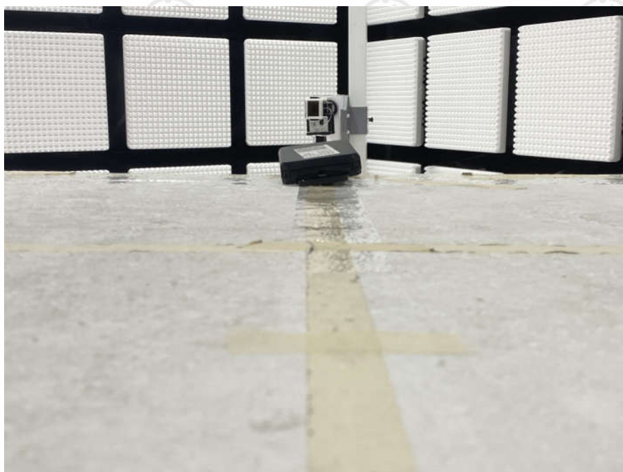
Radiated spurious emission Test Setup-4(Above 18GHz)