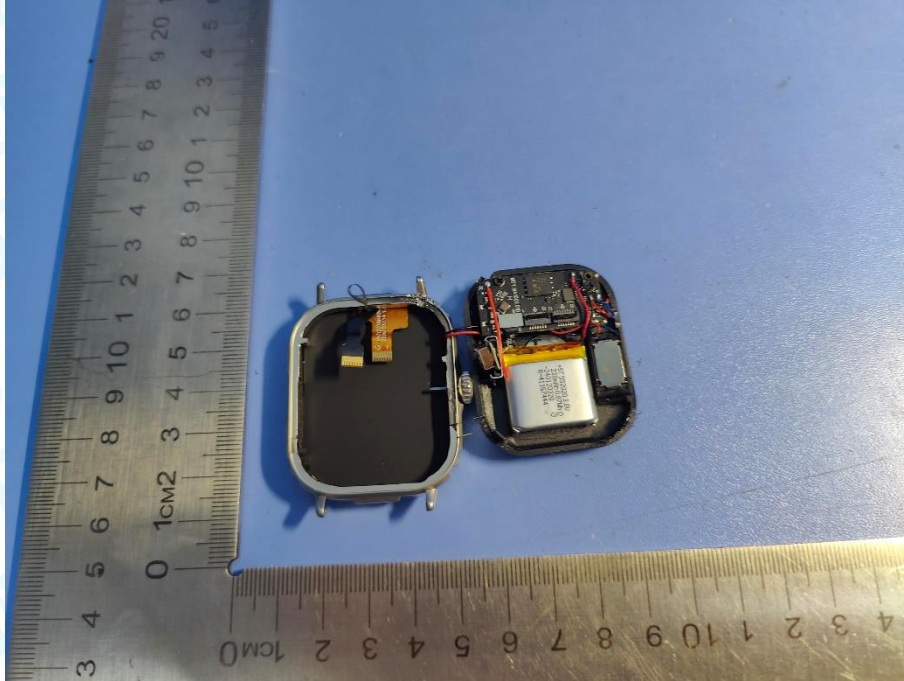
Photo 9 Appearance of PCB