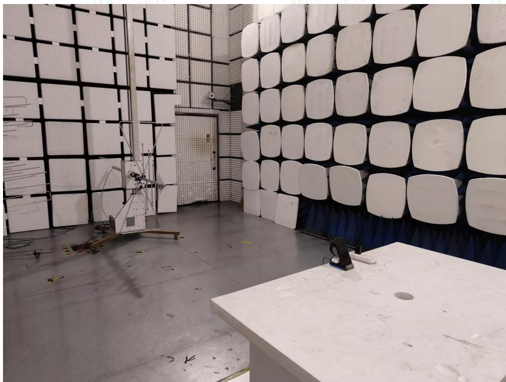
Radiated Emission below 1GHz-AC adapter charge mode