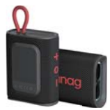
M13S Pro/Max Portable Wireless Speaker