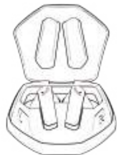
TWS-R03 Usage Guide