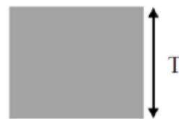
( Side View )