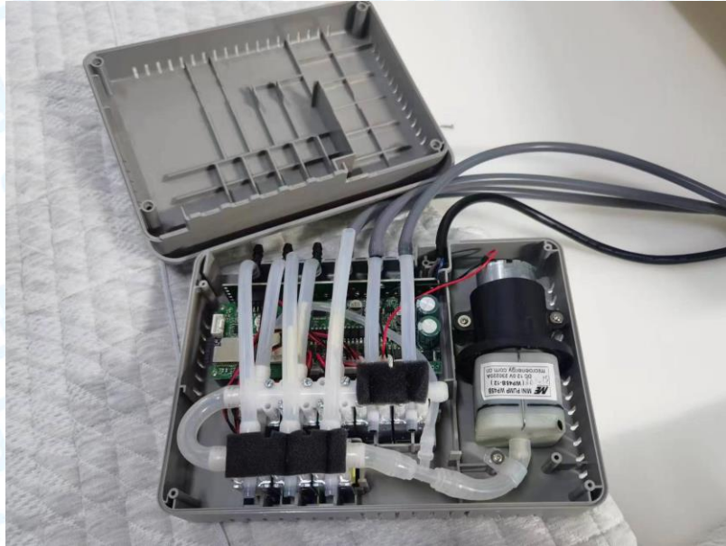
Photo 11 Appearance of PCB