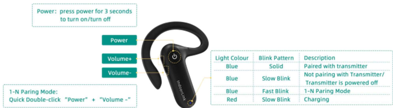
Receiver E103 (Overview)