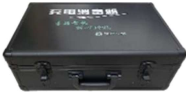
Charging& disinfection Rack