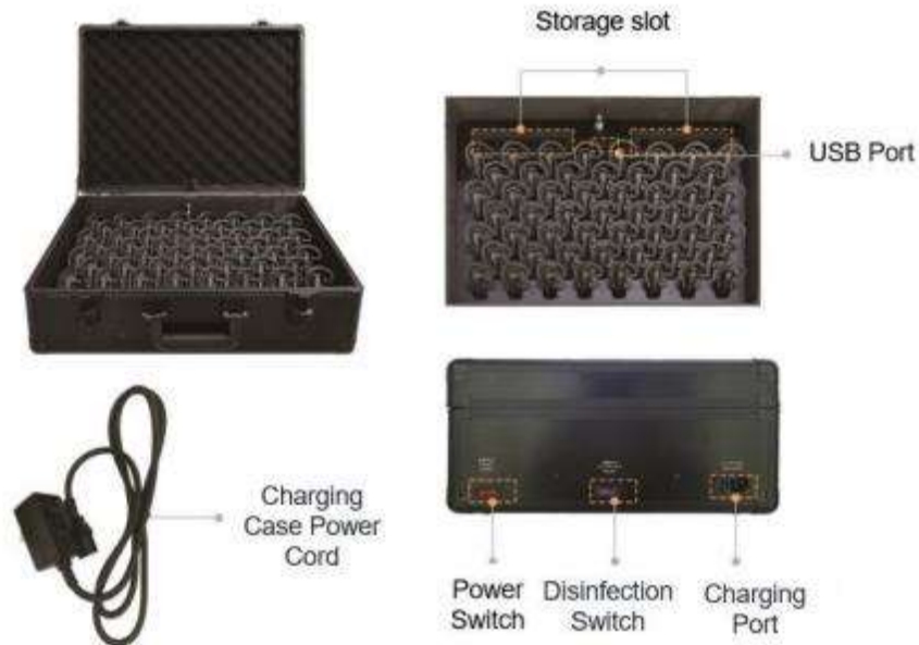
Charging Rack SCH-S311