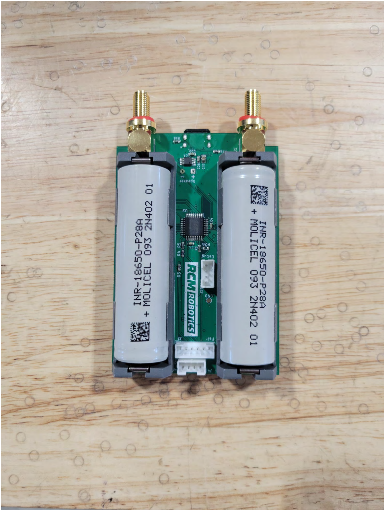
Back Side of PCB