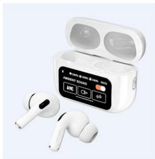
Finished headphones picture