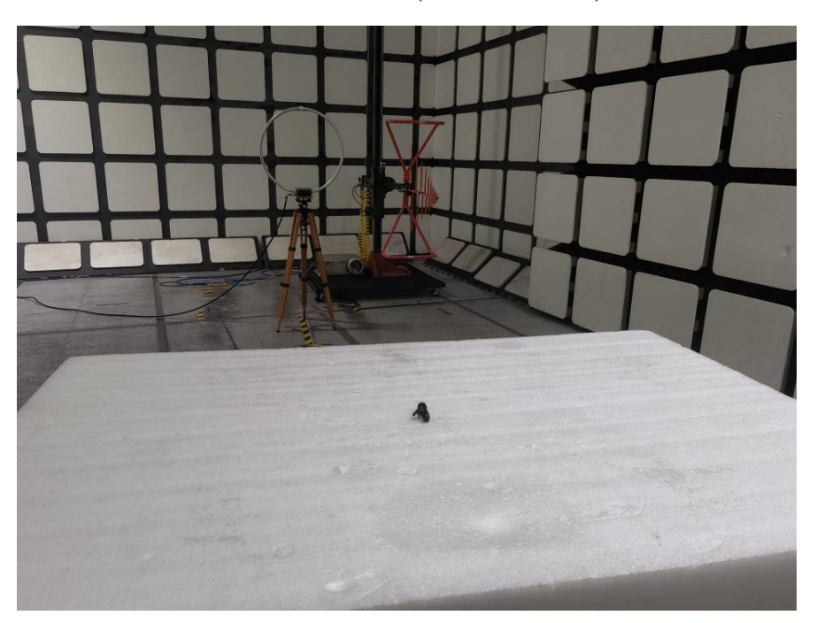
EXHIBIT D - TEST SETUP PHOTOGRAPHS

Radiated Emissions View (9 kHz-30 MHz)-Parallel