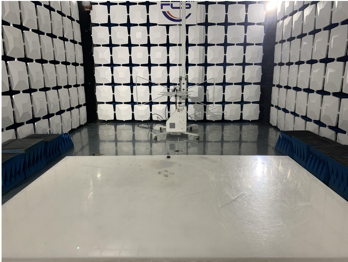
Above 1GHz for radiated emission test setup