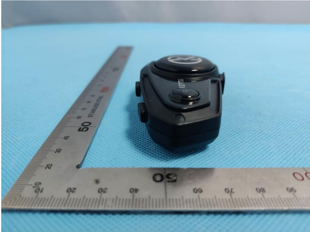
PORT VIEW-1 OF EUT