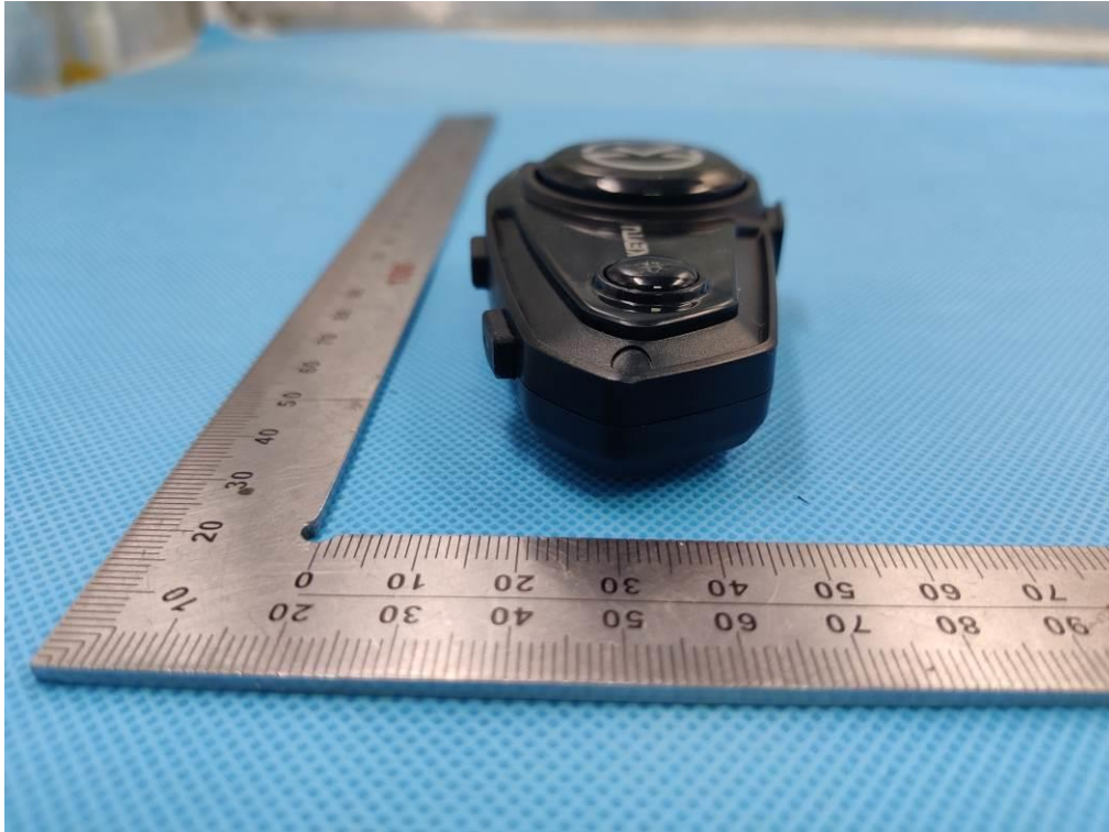
PORT VIEW-1 OF EUT