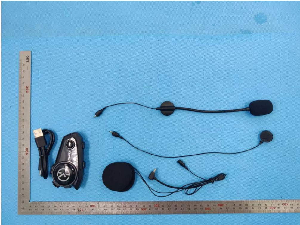
TOP VIEW OF EUT