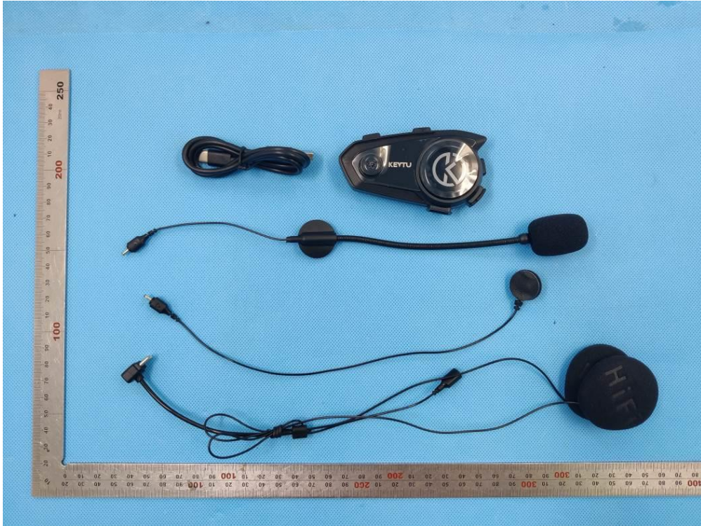
TOP VIEW OF EUT