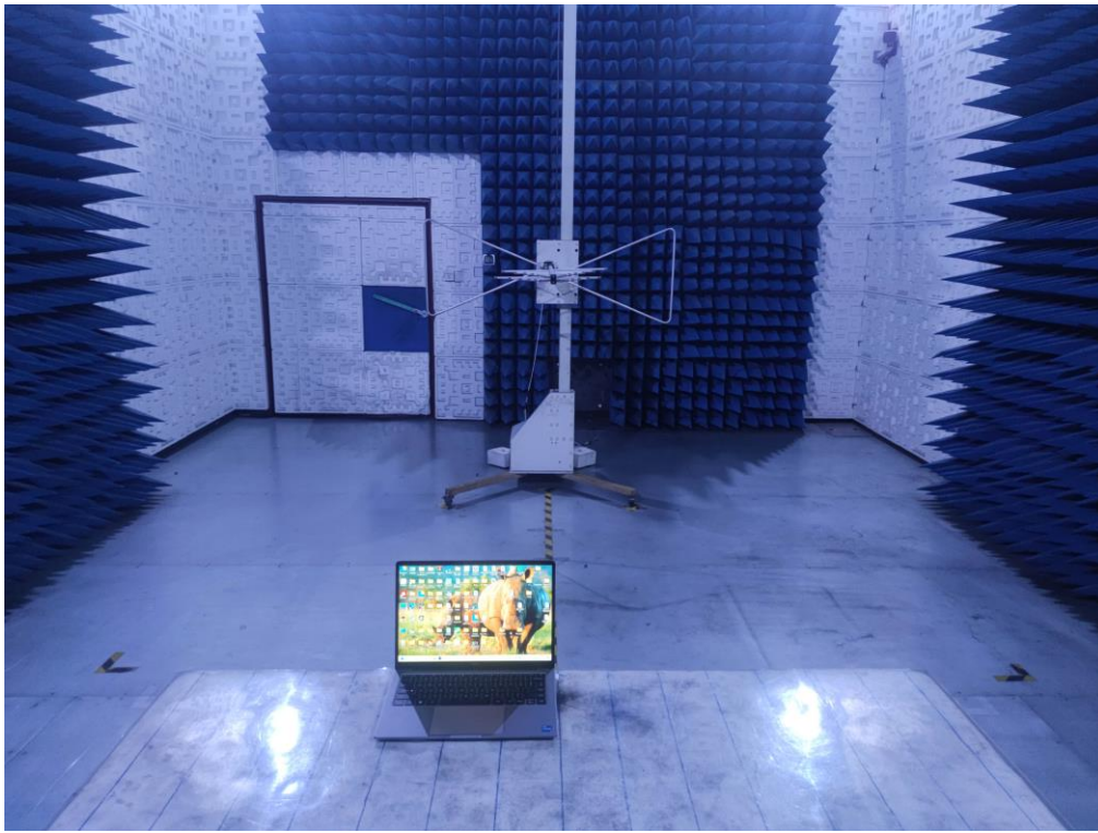
RADIATED EMISSION TEST SETUP ABOVE 1GHz