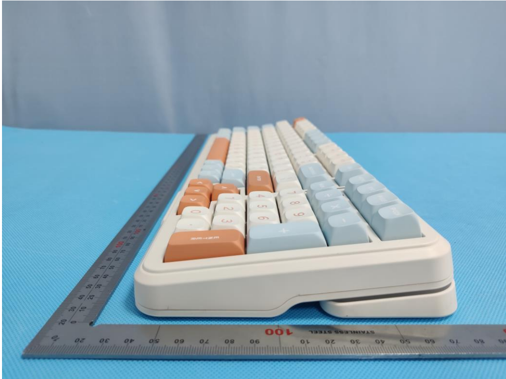
PORT VIEW OF EUT