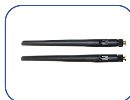
Rubber Duck Antenna*2