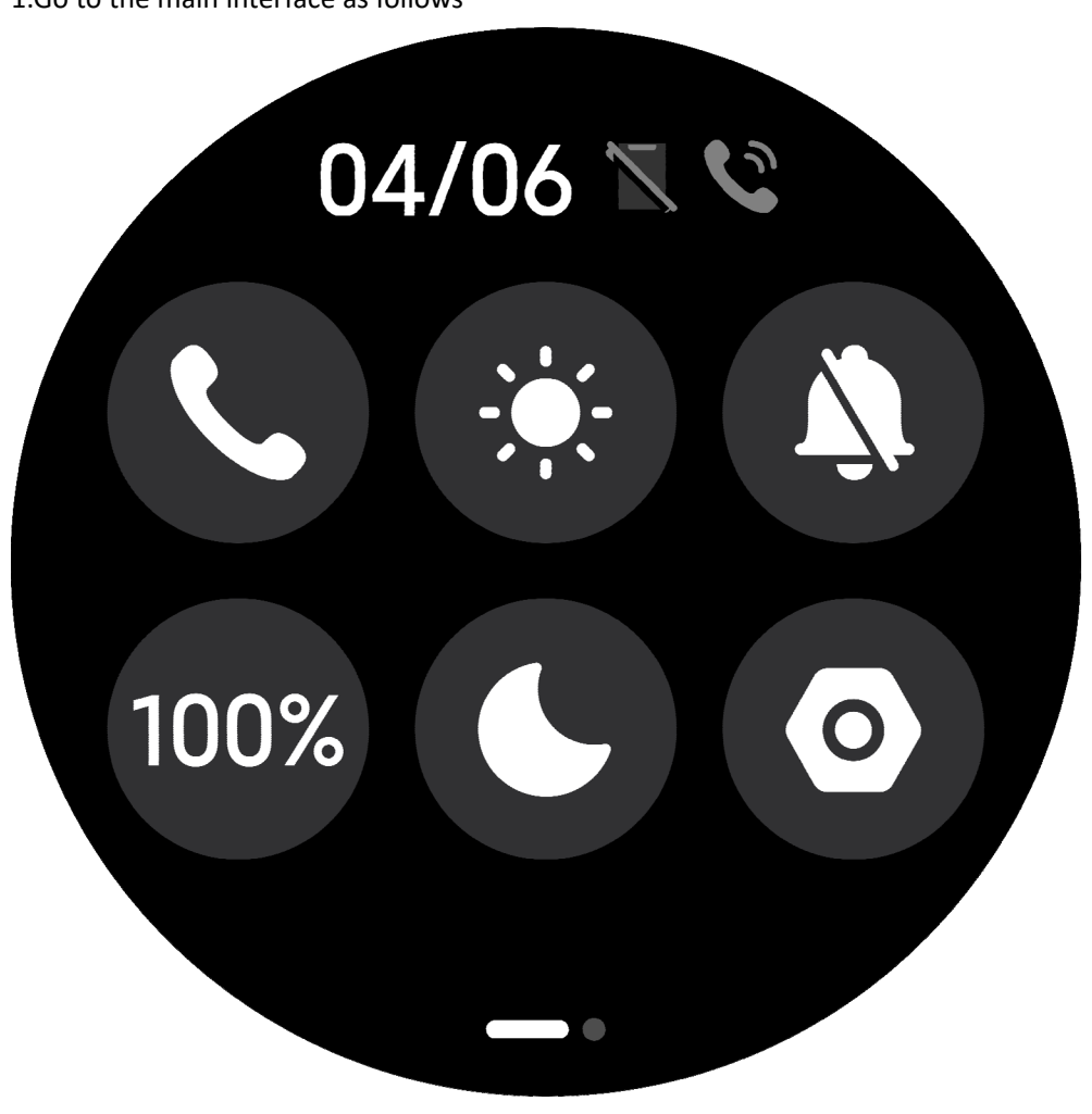
The E-label information To access the e-label information, in the device, 1.Go to the main interface as follows