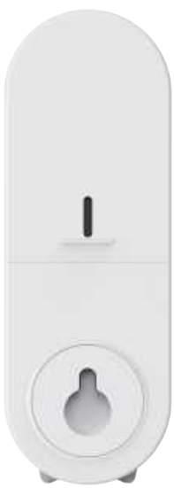
Thank you for your trust, and we'll live up to your expectations.

Tips: In the case of no obstacles, the effective transmission distance of Bluetooth connection is usually within 10 meters, we recommend you to connect and operate Bluetooth devices within 10 meters.