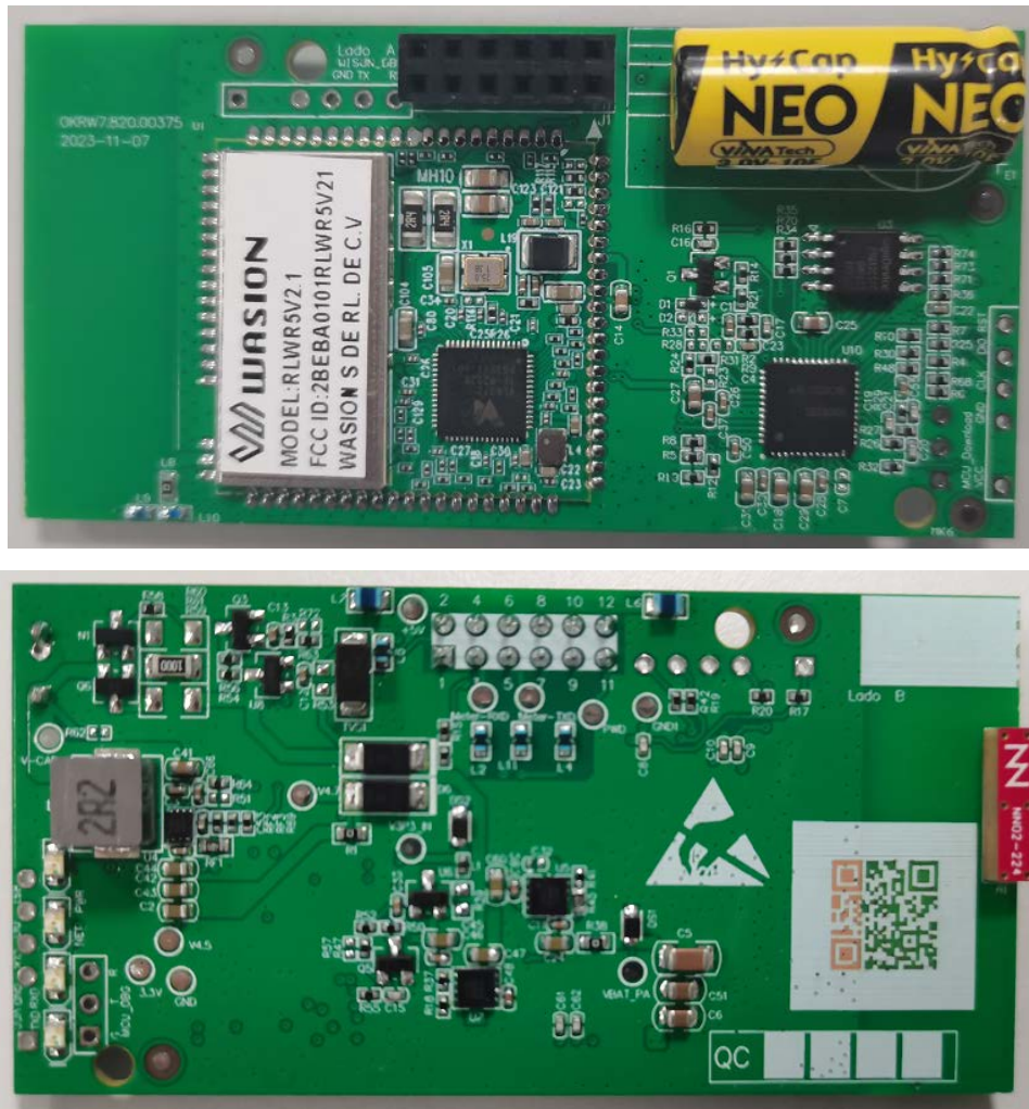
Figure3.2- RLWR5V2.1 NIC