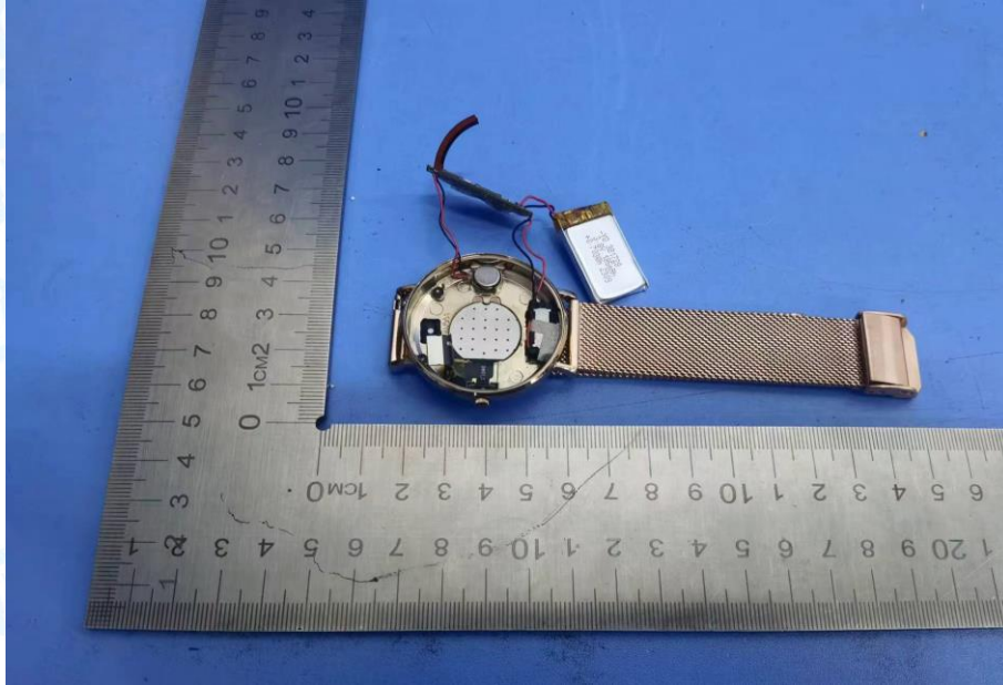
Photo 10 Appearance of PCB & Battery