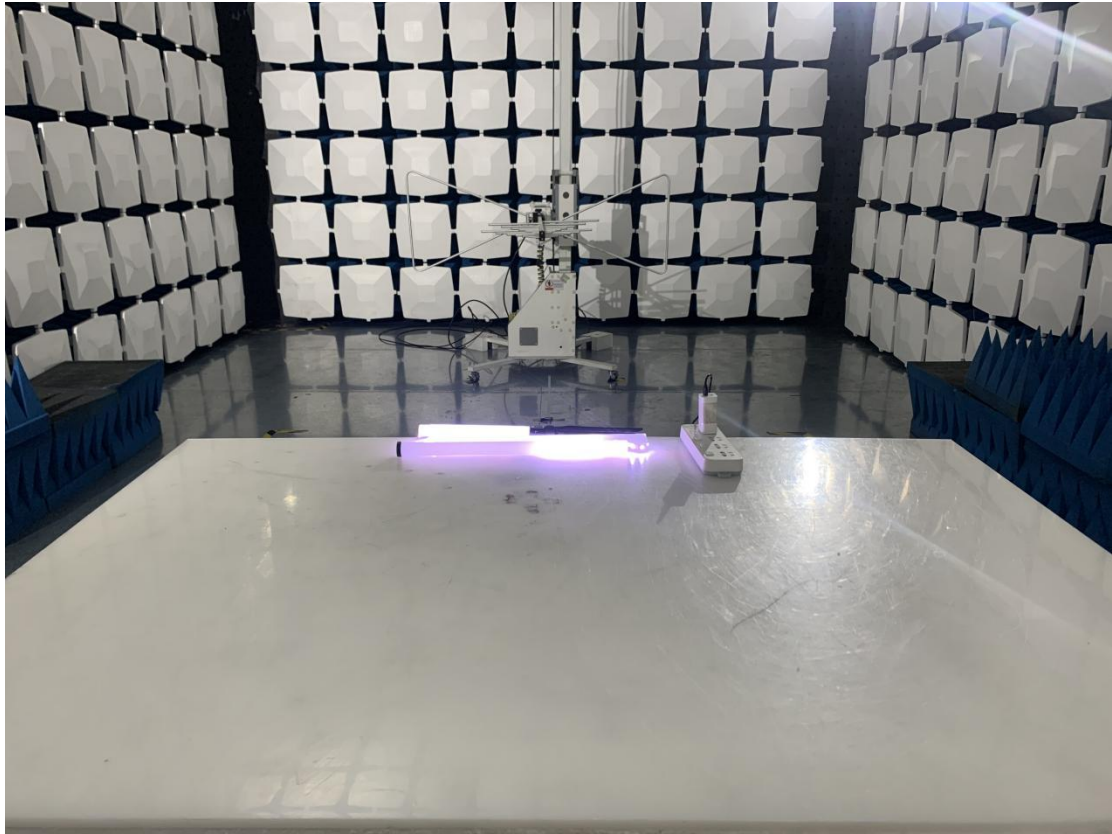
Below 1GHz for radiated emission test setup