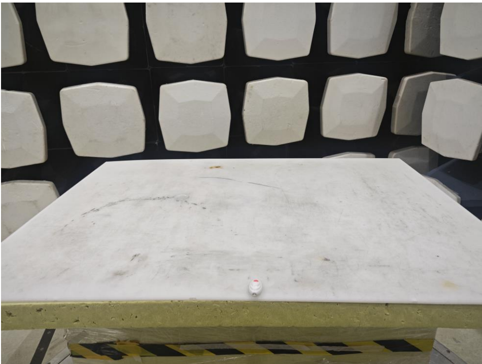
Up to 1GHz (EUT was placed in the centre of the turntable)