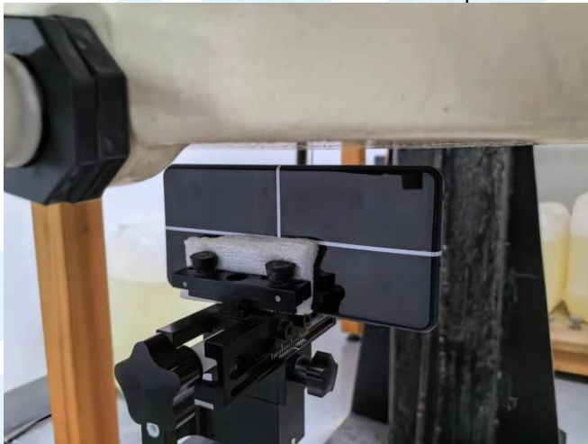
Left Side of EUT with 1 cm Gap