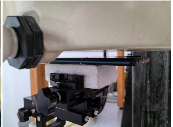
Rear Face of EUT with 1 cm Gap