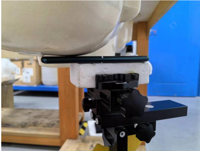
Right Cheek (Head Mode)