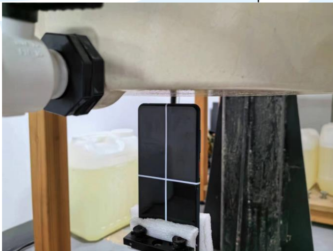
Top Side of EUT with 1 cm Gap