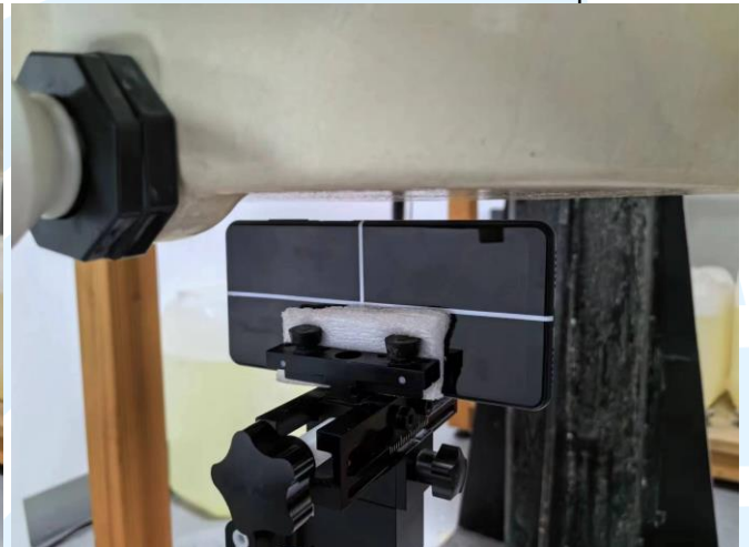
Right Side of EUT with 1 cm Gap