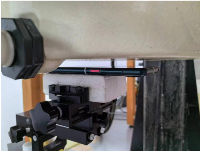
Front Face of EUT with 1 cm Gap