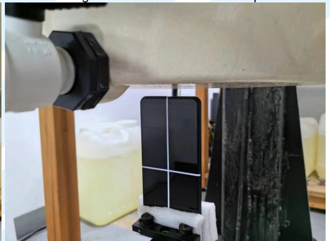
Bottom Side of EUT with 1 cm Gap