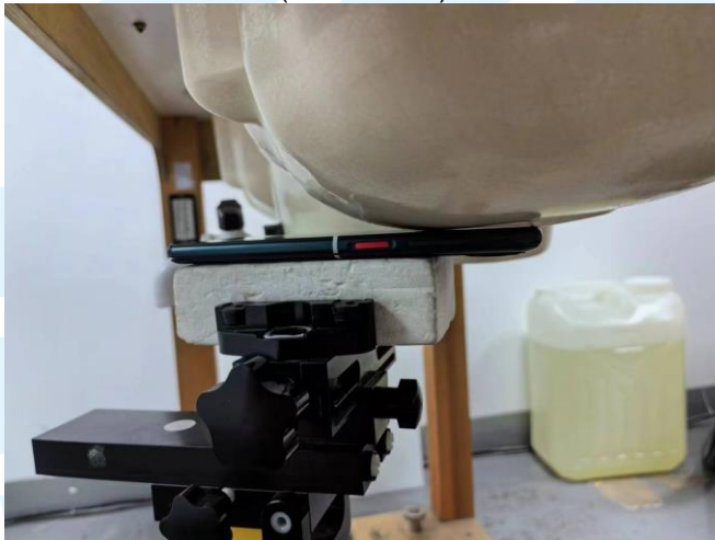
Left Cheek (Head Mode)