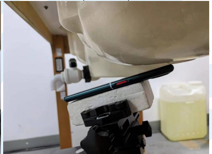
Left Tilted (Head Mode)